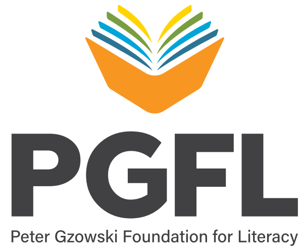
Vertical version (secondary)