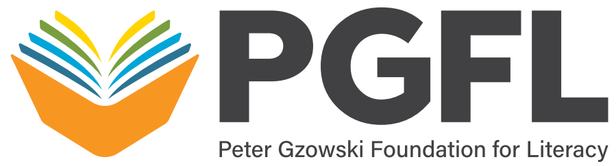
Horizontal version (primary)